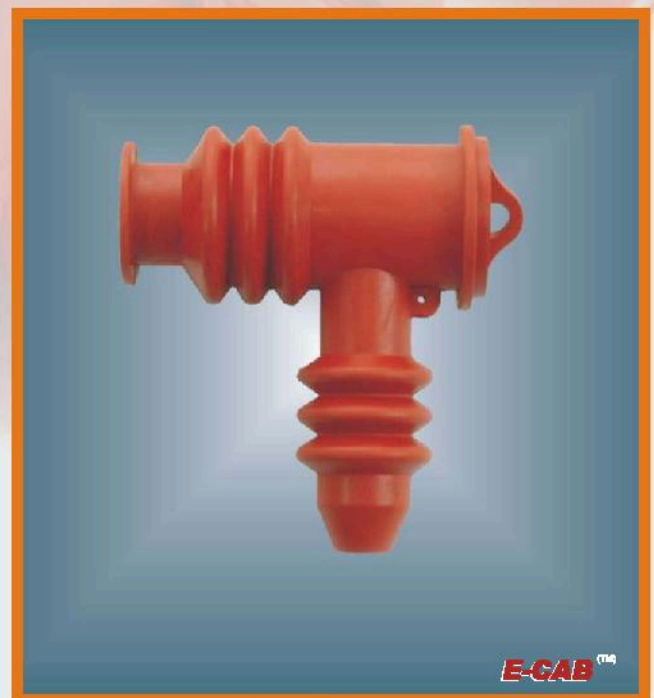
EPDM Cold Applied Boot