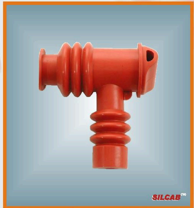
Silicon Cold Applied Boot